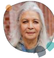
Professor Dr Marcia Langton AO , Co-Chair, Senior Advisory Group, Indigenous Voice