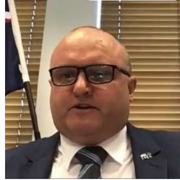
The Hon Jason Wood MP, Assistant Minister for Customs, Community Safety and Multicultural Affairs

Monday 22nd February, ACCI Video Conference with the Hon Jason Wood MP, Assistant Minister for Customs, Community Safety and Multicultural Affairs