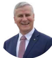
The Hon Michael McCormack MP , Deputy Prime Minister