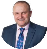
The Hon Jason Wood MP , Assistant Minister for Customs, Community Safety and Multicultural Affairs