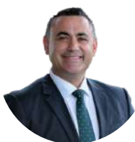
The Hon John Barilaro MP , Deputy Premier of NSW, and Minister for Regional New South Wales, Industry and Trade