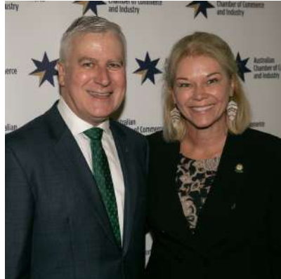
The Hon. Michael McCormick MP, Deputy Prime Minister and The Hon. Katrina Hodgkinson, Director, Government and Regulatory Affairs, AARNet