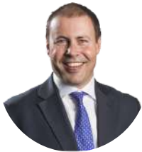
The Hon Josh Frydenberg MP , Treasurer of Australia