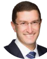
Julian Leaser MP , Chair, Joint Standing Committee on Migration & Chair, Standing Committee on Indigenous Affairs