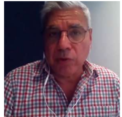
Nyunggai Warren Mundine AO, Chairman and Managing Director, Nyungga Black Group